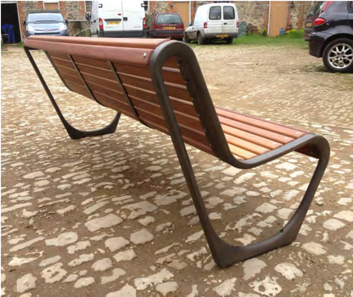
Bath Street Furniture by PearsonLloyd

Combined with a new wayfinding system, the street furniture will see the City of Bath entering a new phase in its development as part of a wide ranging scheme to improve the public realm.