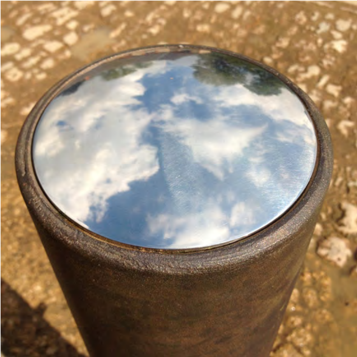
Bath Street Furniture by PearsonLloyd

heritage.” says PearsonLloyd. “The emphasis was placed on pure geometry to connect Bath’s famous Georgian architecture with the every day needs of the city’s citizens and visitors.”