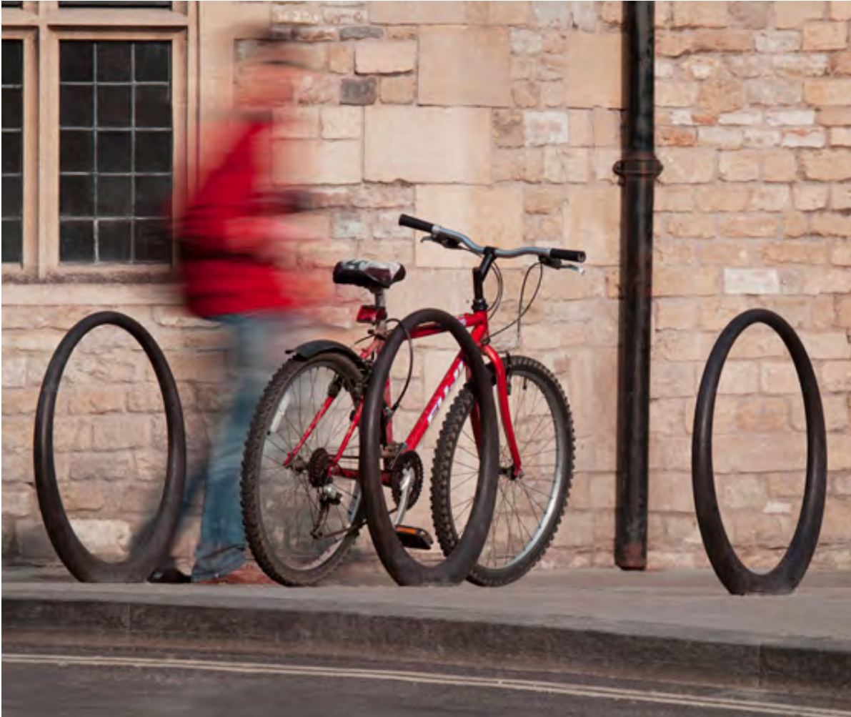
Bath Street Furniture by PearsonLloyd

Posted by Walter Phillips on 28.08.2013 - Tagged as: PearsonLloyd