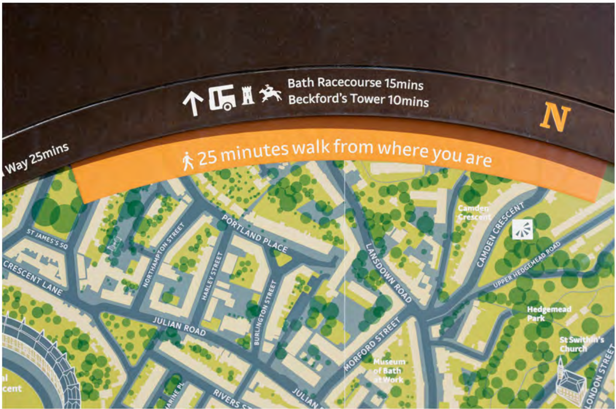
way-finding graphics merge pedestrian and transport routes