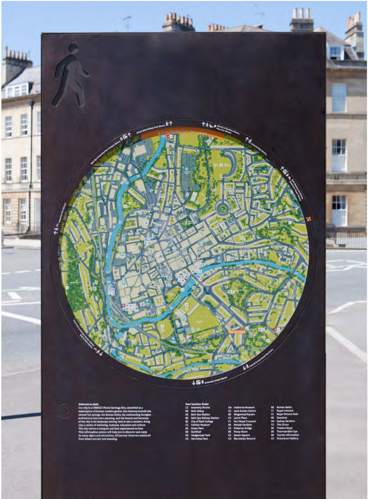
the project draws from bath's status as a model city of the age of enlightenment