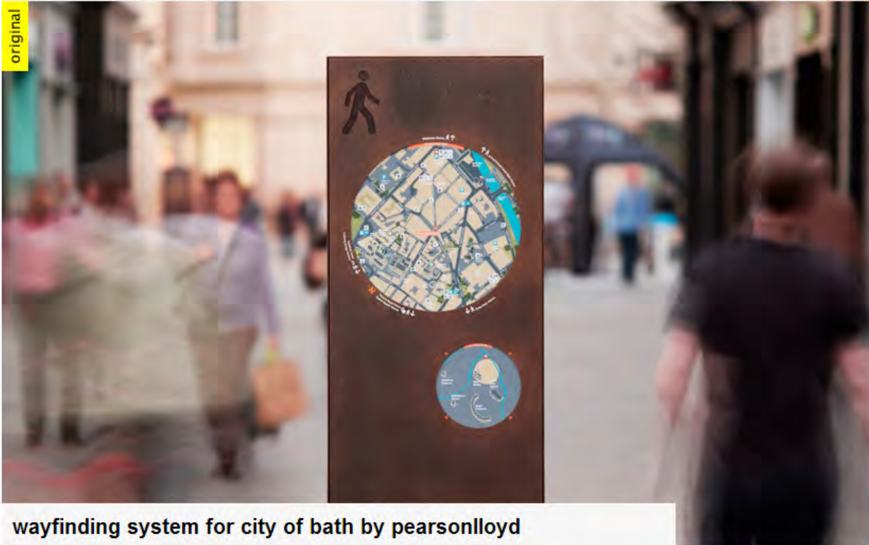
wayfinding system for city of bath by pearsonlloyd