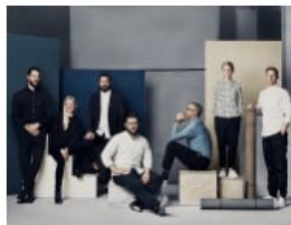
'The division between home & contract furniture has almost disappeared'