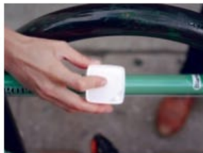
Top tech start-ups from LDF 2015