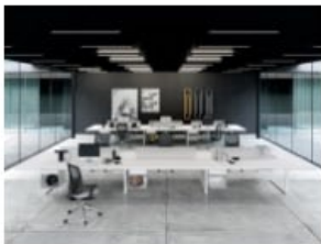
Frezza UK: simply beautiful, intelligent workspaces