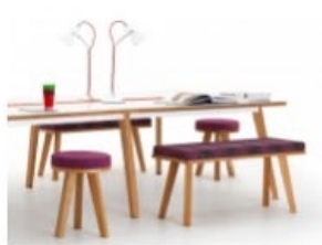
Verco at work