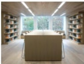
The community table